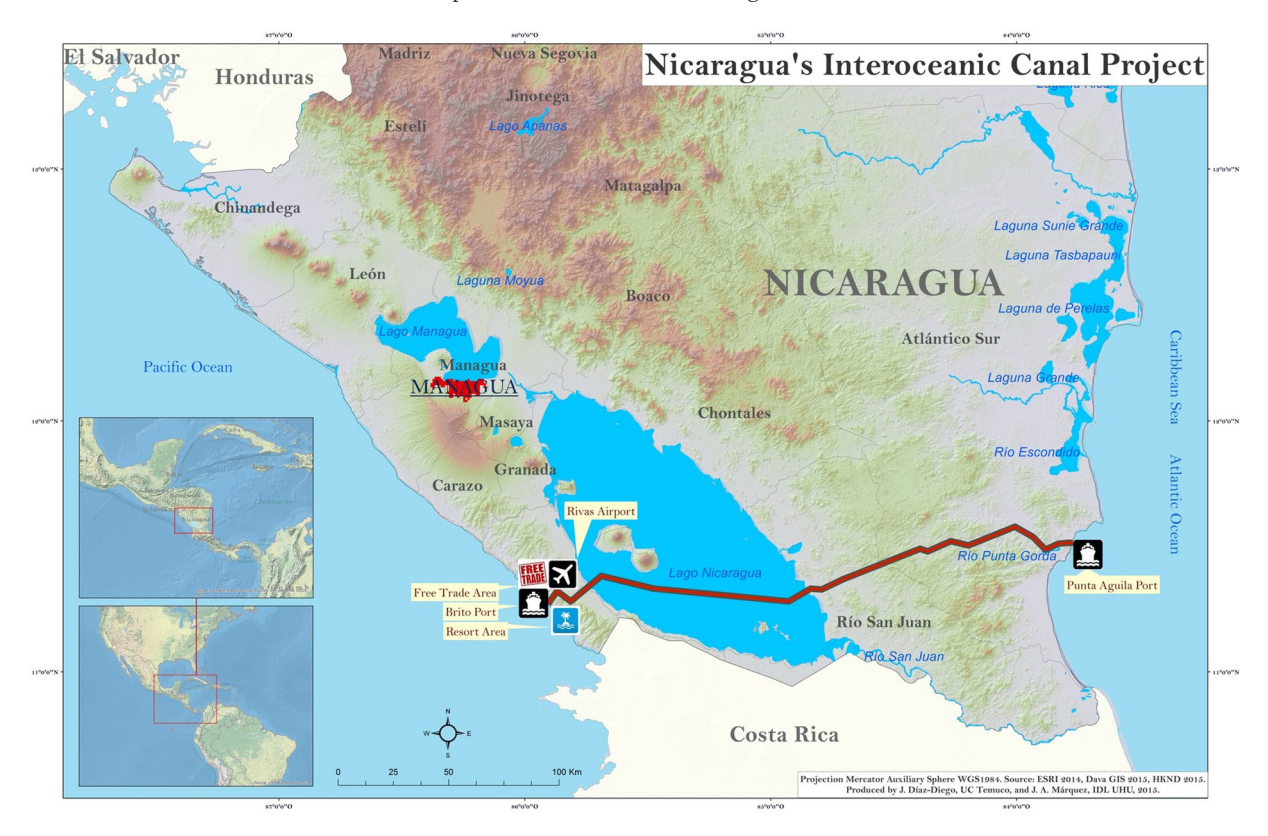
Map 2. Final Route of the Nicaragua Canal

The entry to the Caribbean is near the Cerro Silva Natural Reserve, home of jaguars, possums, sloths, tapirs or poison-dart frog, among others. The project crosses 15 kilometers of indigenous lands between Punta del Aguila and Monkey Point, where in addition to obviously subvert the local life style, it affects the life cycles of sea turtles and coastal dolphins or Guyana's dolphins, as well as threatening the ecological balance between freshwaters and saline waters. Cerro Silva must be taken into consideration as it is already suffering from the transformation of its grazing areas in the forest, the erosion of its slopes, whose lands settle in their riverbeds and logging and hunting as a result of the scarce environmental awareness of a population with difficult socio-economic conditions. Further west, the Canal will go through the San Miguelito Ramsar Wetland from the South, an area that has already been impacted by agriculture and invasive plant species.